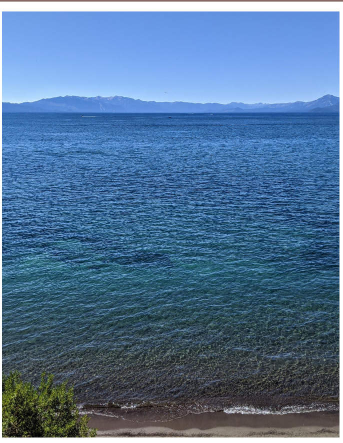
DPA Newsletter Page 6