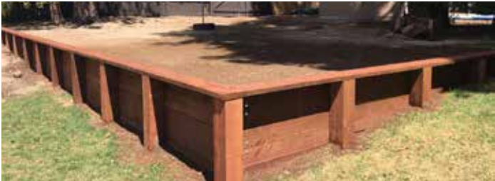
The site is finished and we expect the new equipment to be installed and “open for play” in early June.